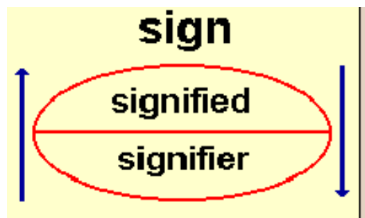
Figure2. Saussure's sign schema (culled from David Chandler)

The notion that language is arbitrary is a celebrated aspect of Saussure's programme. In his own definition, Saussure itemizes language among the other semiotic systems claiming that "...it is the most important of all these systems" (16). Further explaining the nature of language, Saussure notes that it is built on the scaffold of signs with the claim that an instance of the linguistic sign will always produce two aspects – the signifier and the signified. Consider the following diagram: